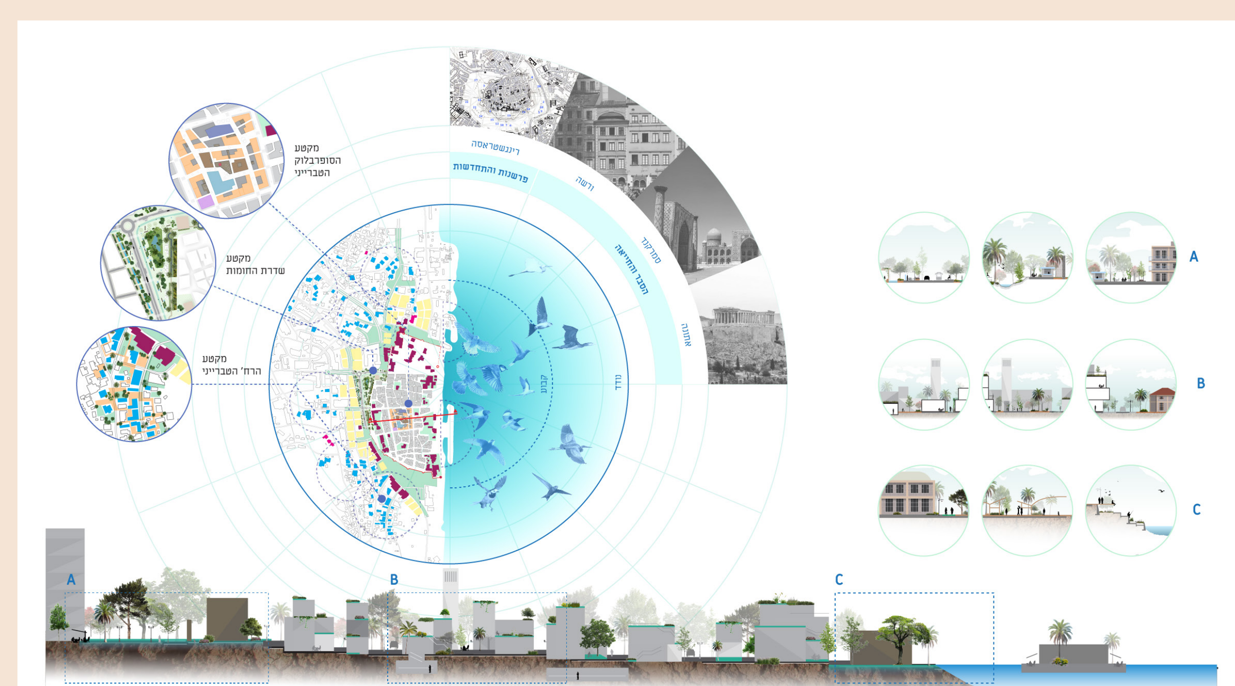
Chronicle of an ongoing destruction and building within historic cities. The case study of Tiberias. Ori Raibi

Urban heritage, both tangible and intangible, reflects past and present human diversities, fostering social cohesion and resilience. The program views heritage as layered cultural and natural values that extend beyond traditional "historic centers," integrating broader urban and geographic contexts. Graduates gain the multi-disciplinary skills in conservation enabling sustainable development.