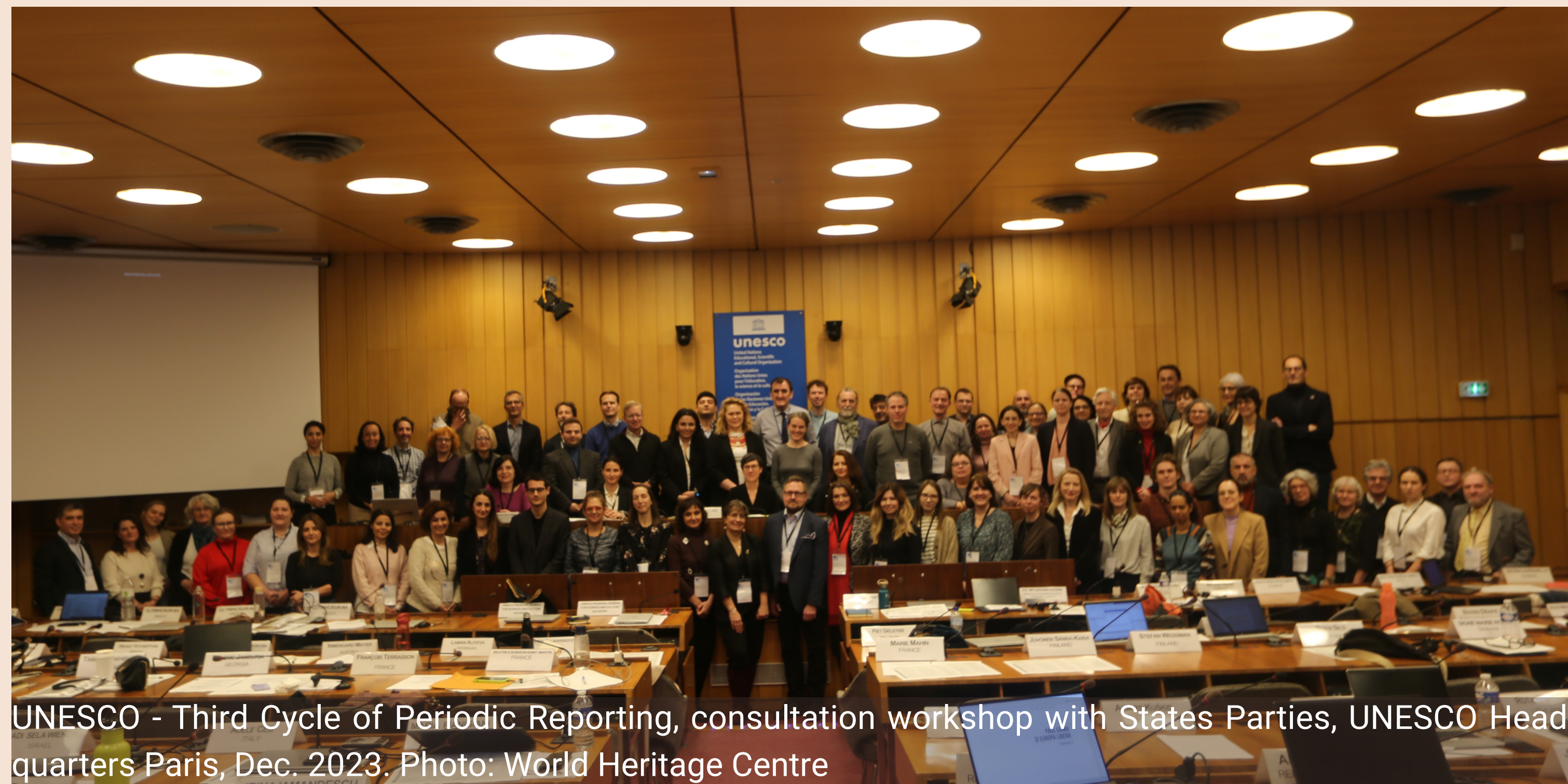
UNESCO - Third Cycle of Periodic Reporting, consultation workshop with States Parties, UNESCO Headquarters Paris, Dec. 2023.