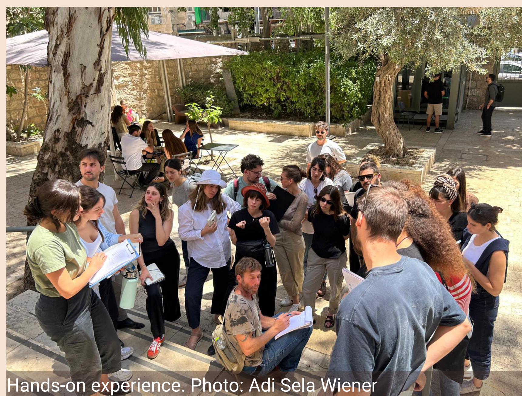
Hands-on experience.