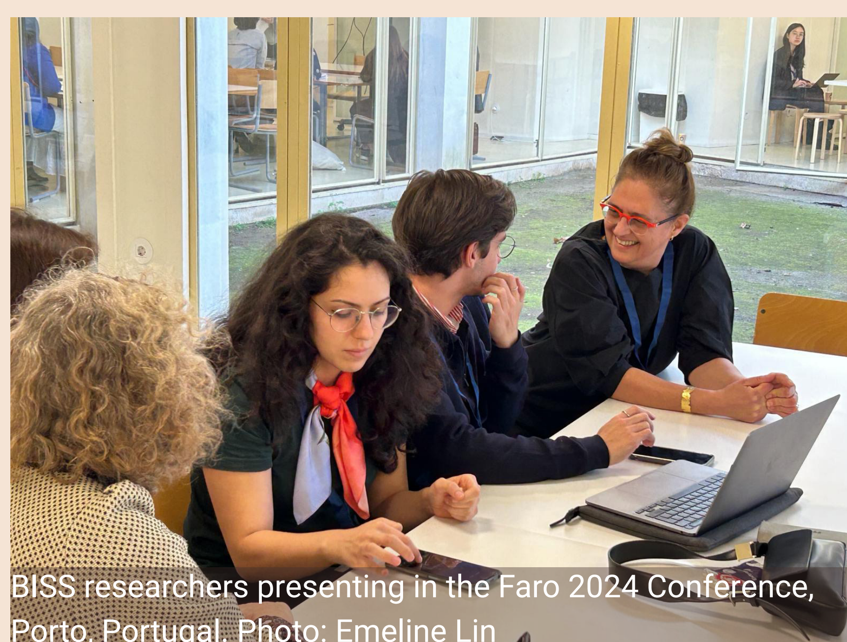
BISS researchers presenting in the Faro 2024 Conference, Porto, Portugal.

The Sustainable Development Hub at Bezalel promotes environmental-conscious design by integrating ecological, social, and cultural considerations. Through research, education, and partnerships, it embeds sustainability in Bezalel's activities, supporting its Green Campus status and addressing climate change with responsible, innovative design practices.