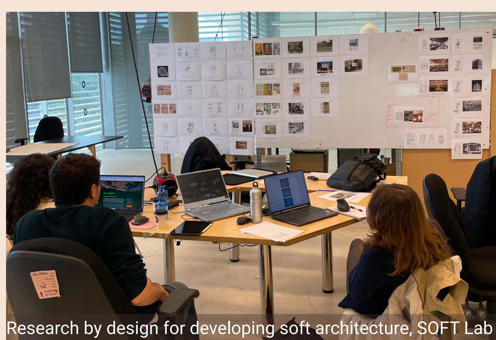
Research by design for developing soft architecture, SOFT Lab