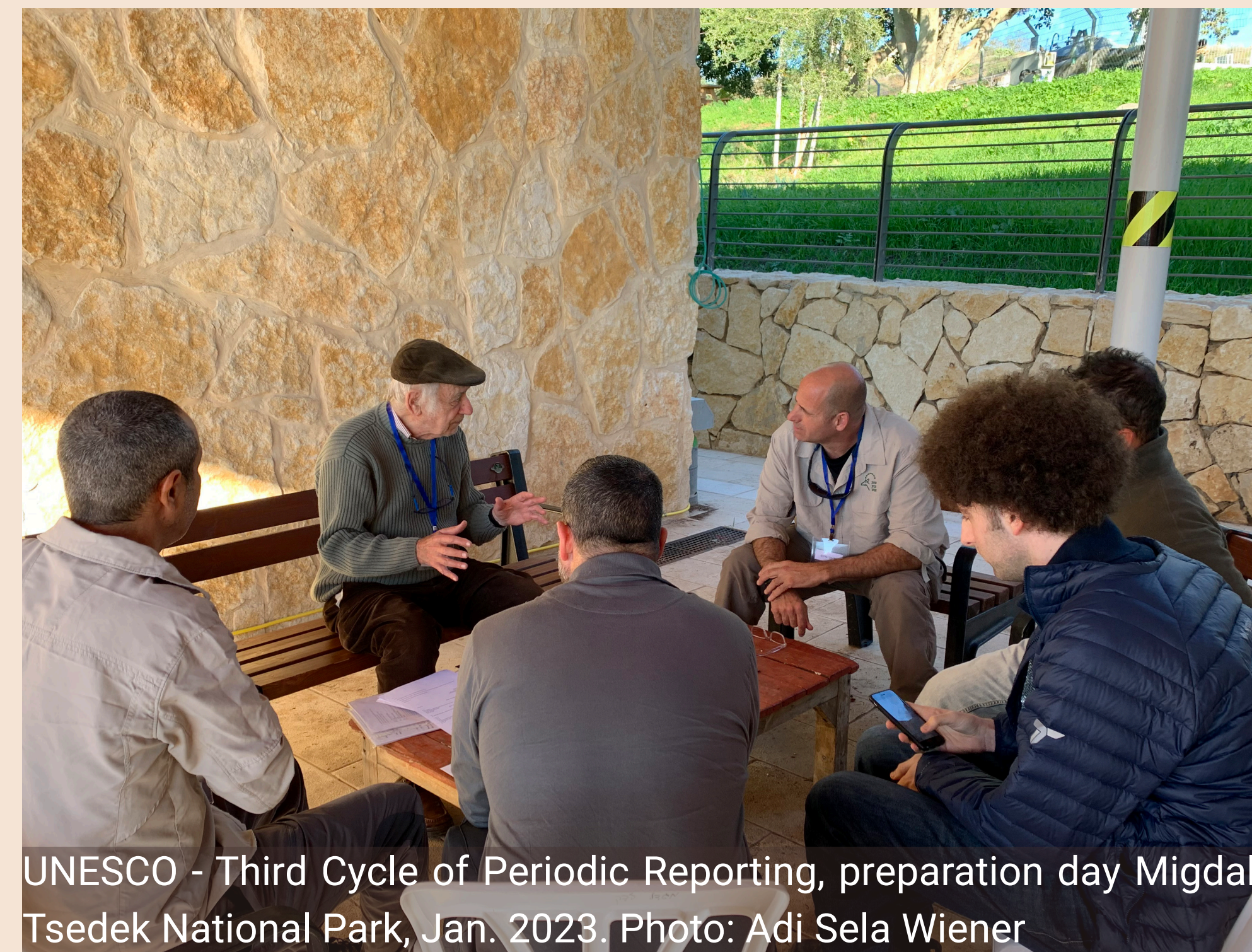
UNESCO - Third Cycle of Periodic Reporting, preparation day Migdal Tzedek National Park, Jan. 2023.

Leading and promoting theoretical and applied research across the spectrum of art, architecture and design the Chair has been a catalyst for interactions with other fields and in supporting activities for regional peace and dialogue. The Chair over the past years has partnered MoHoA, the Modern Heritage of Africa initiative and the UN-Habitat Heritopolis partnership for Heritage and the Metropolis.